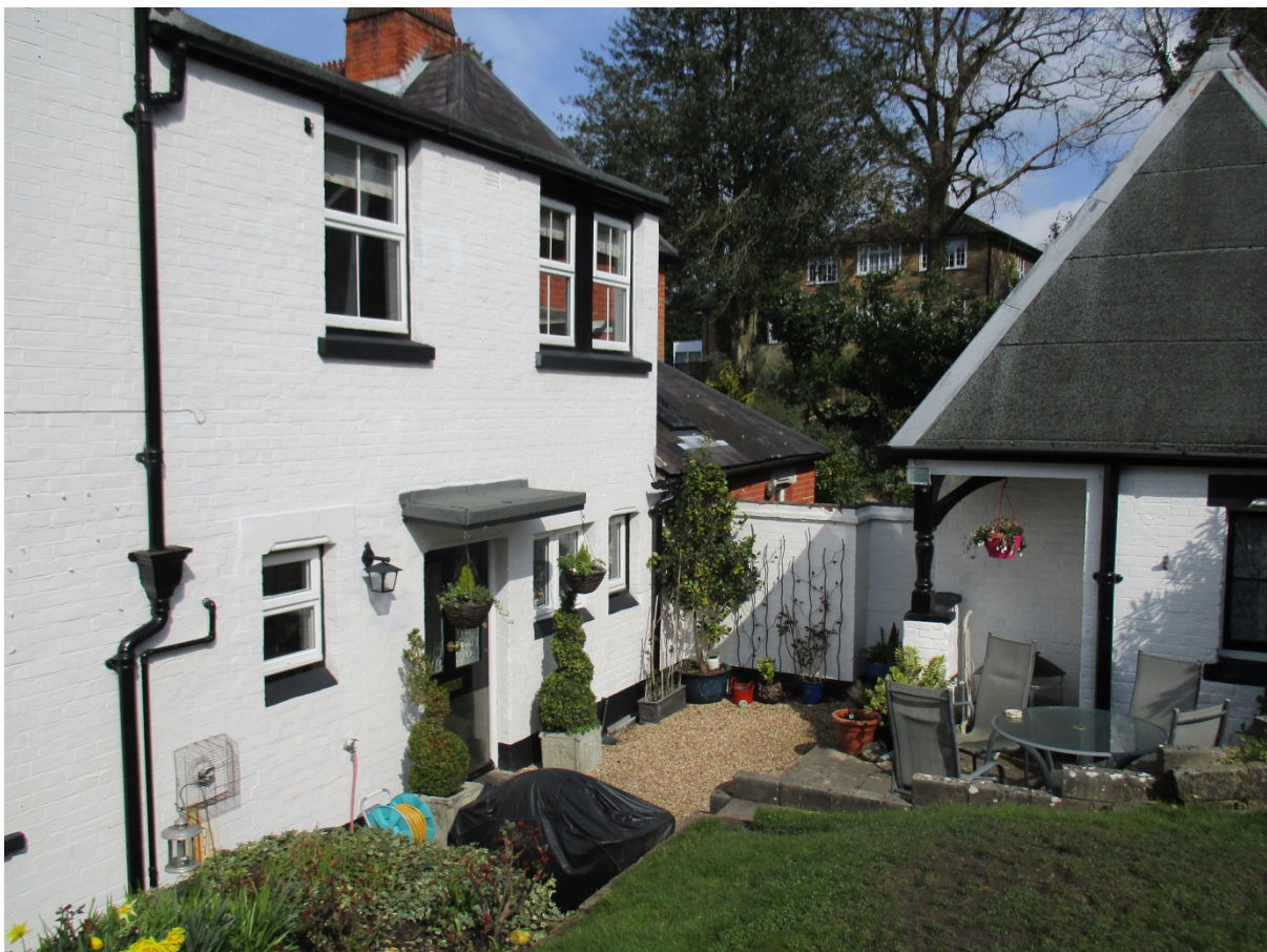
View from the front garden, showing the front elevation, the site boundary and beyond the boundary.