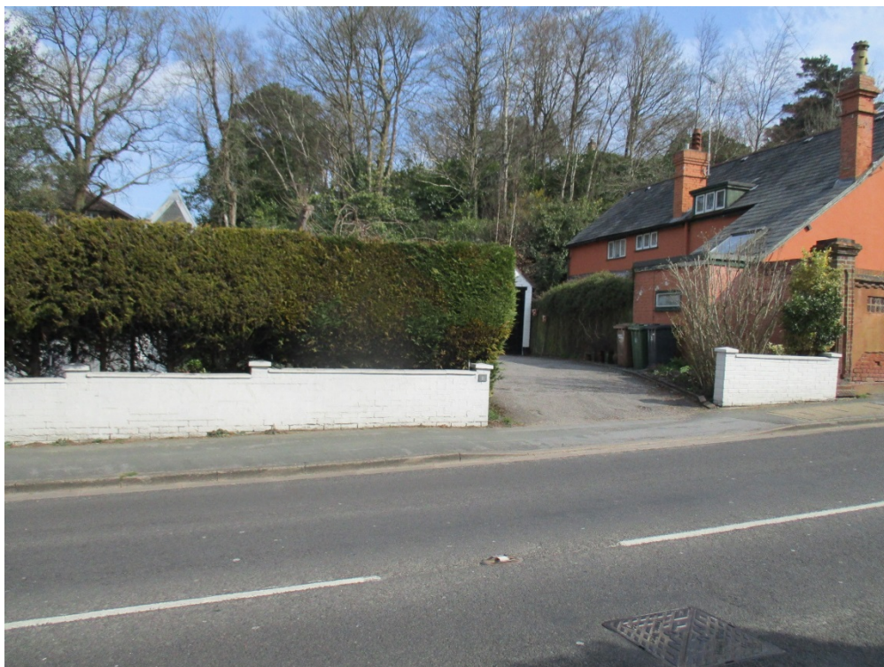
View of the application site from Church Hill Road.

16/0274 – 11 CHURCH HILL, CAMBERELY, GU15 2HA