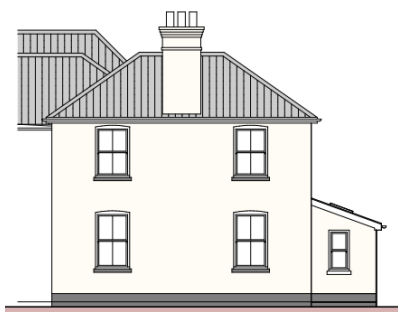
Front Elevation (Facing Church Hill)