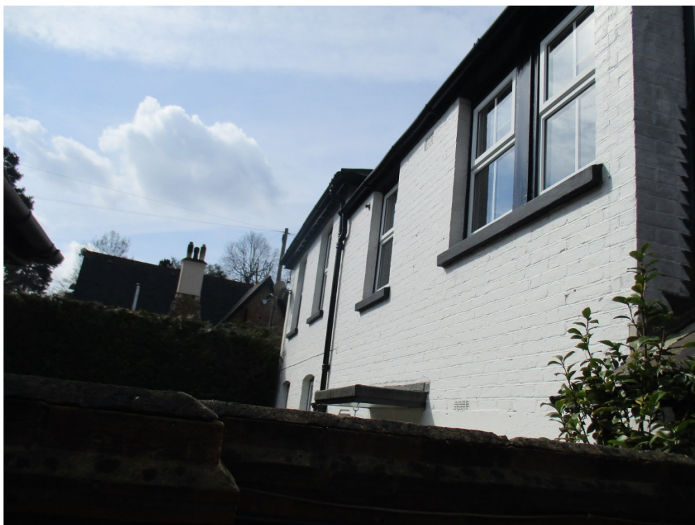
View from the neighbour's garden.

16/0274 – 11 CHURCH HILL, CAMBERELY, GU15 2HA