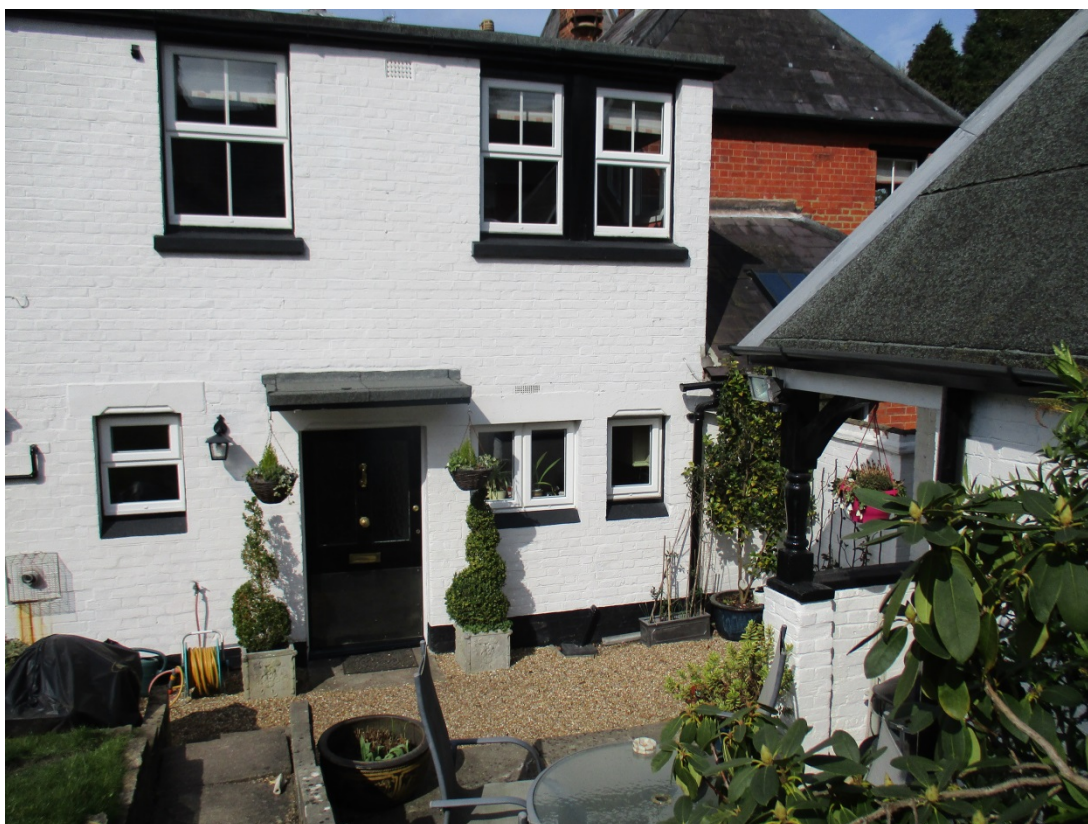
View of the front elevation of the application site.