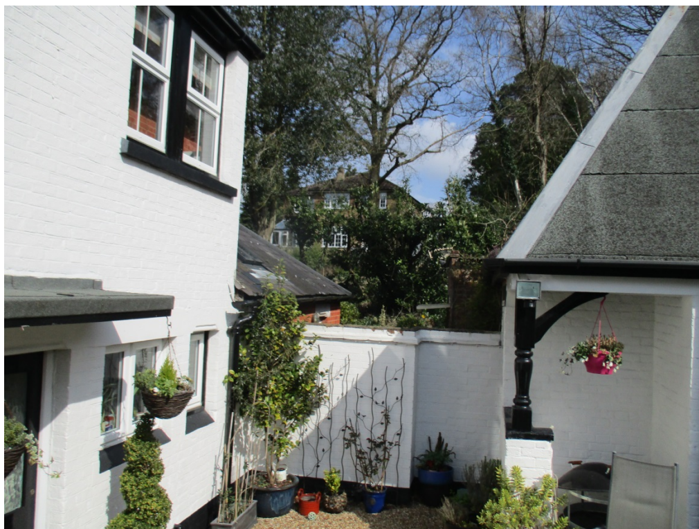
View of the shared boundary with the neighbour.